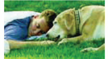
Everything I needed.

I asked for a companion that I might not feel lonely; I was given a best friend that I would feel loved. I got nothing I asked for, But Everything that I needed. -Anonymous