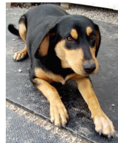
Ready for rough and tumble kid fun.