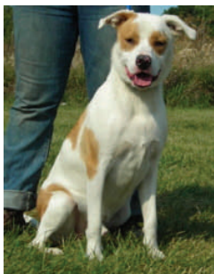
Carlton takes the time from fun and frolicking at Bark Til Dark Park to write home.