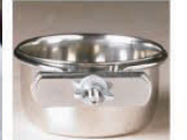
Bowl can be purchased online at DrsFosterSmith.com

The Humane Society of Madison County is celebrating Sweet Shelley - the Shelter Greeter's Birthday.