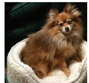
The Dog Formerly Known as Prince.