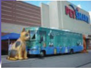
The Rescue Rover is almost here! Stop by and see it.

The 2009 North Shore Animal League's Tour for Life is on its way. Beginning on March 25th two of their Rescue Rovers started their trek homeward from California and Southern Florida. The Rovers will make scheduled stops, hosting events with local shelters.