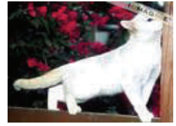
This cat is marking territory and leaving a cat e-mail.